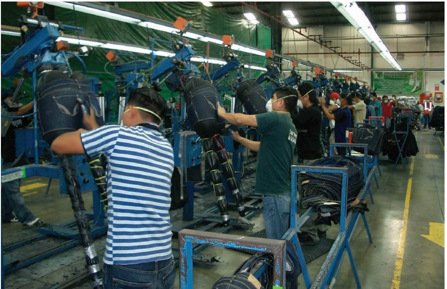
Garments are placed on inflatable jean mannequins allowing a flat surface for workers to use sand paper to distress the fabric, creating "worn patches," before the newly sewn product is washed.