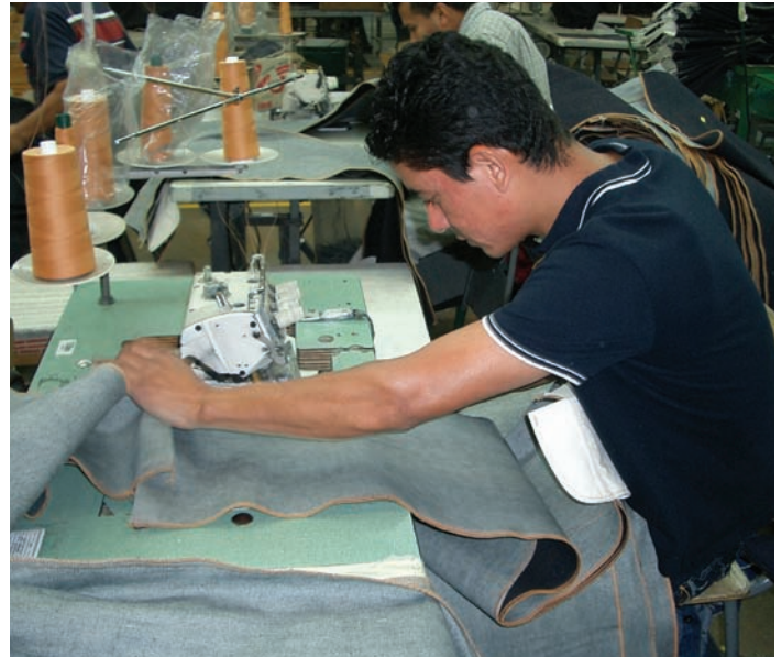
Using a double-needle sewing machine, employees take great care in stitching all garments to meet quality standards.

By expanding into apparel manufacturing, PCCA is continuing its tradition of innovation, leadership and forward thinking. 🍌